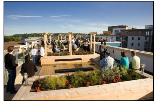
Communal living space provision at the award winning The Zone, Bristol

Food Production Green roofs can be used to provide areas to grow food, similar to an allotment, thereby reducing the ecological footprint of an urban area and supporting local sustainable produce production.